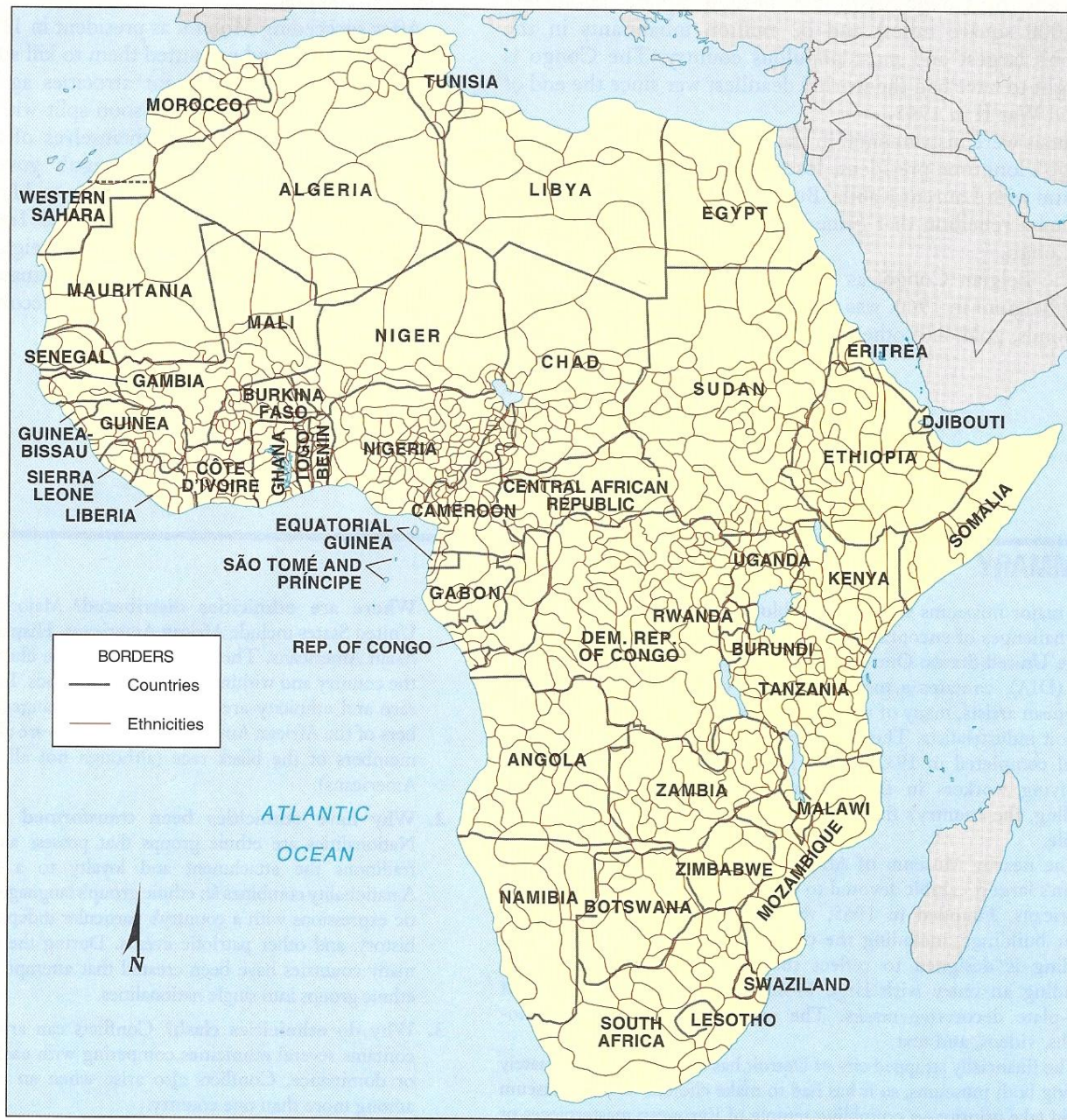
FIGURE 7-23 Ethnicities in Africa. The boundaries of modern African states do not match the territories long occupied by thousands of ethnic groups. State boundaries derive from the administrative units imposed by European colonial powers a century ago.